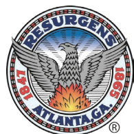
Kasim Reed Mayor of Atlanta

A handwritten signature of Kasim Reed in black ink, written in a cursive style.